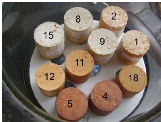
Fig. 3. Specimens treated at 1580 and 1700 °C

The differences in closed porosity between specimens of nonmilling and milling alumina were small. Closed porosity was low in specimens of raw clay and increased with temperature increasing. It also has increased with temperature in specimens of benefited clay, as can be seen in the Figure 4 and Figure 6. The specimens of benefited clay have had a great amount of closed pores and their dimension particularly increased with temperature increasing.