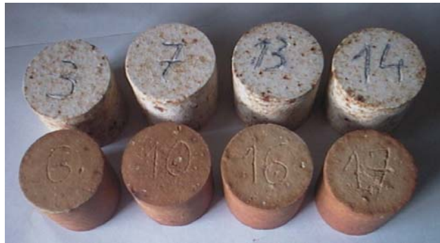
Fig. 5. Specimens treated at 1635 °C (3+7- "SN"; 13+14- "SM"; 6+10- "BN"; 16+17- "BM")