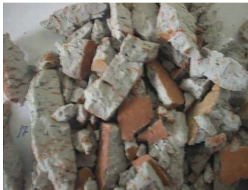
Fig. 6. Destroyed "BM" at 1635 °C