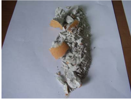
Fig. 4. Destroyed "BM" at 1580 °C